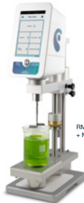
RM 100 CP 1000 + MS-KREBS

MS CP (p80), MS-RV (p75)*, MS-VANES (p77)*, MS-KREBS (p77)*, (* with adaptor Ref. 800146).