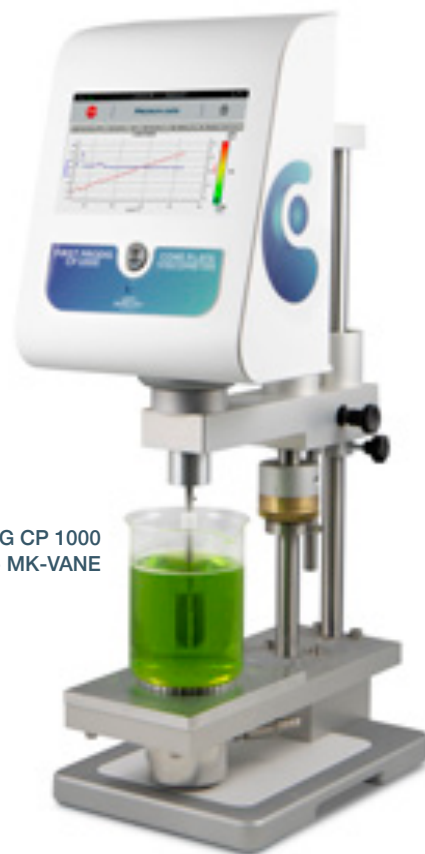
FIRST PRODIG CP 1000 + MK-VANE