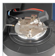
› Electrical Ignitor