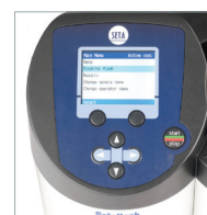
› Easy to use Menu System