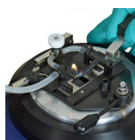
› Dip test flame, flash detection is automatic