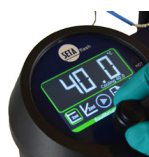
› Select test temperature