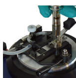
› Inject 2ml sample