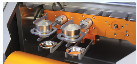
Dual Position (X-300D)