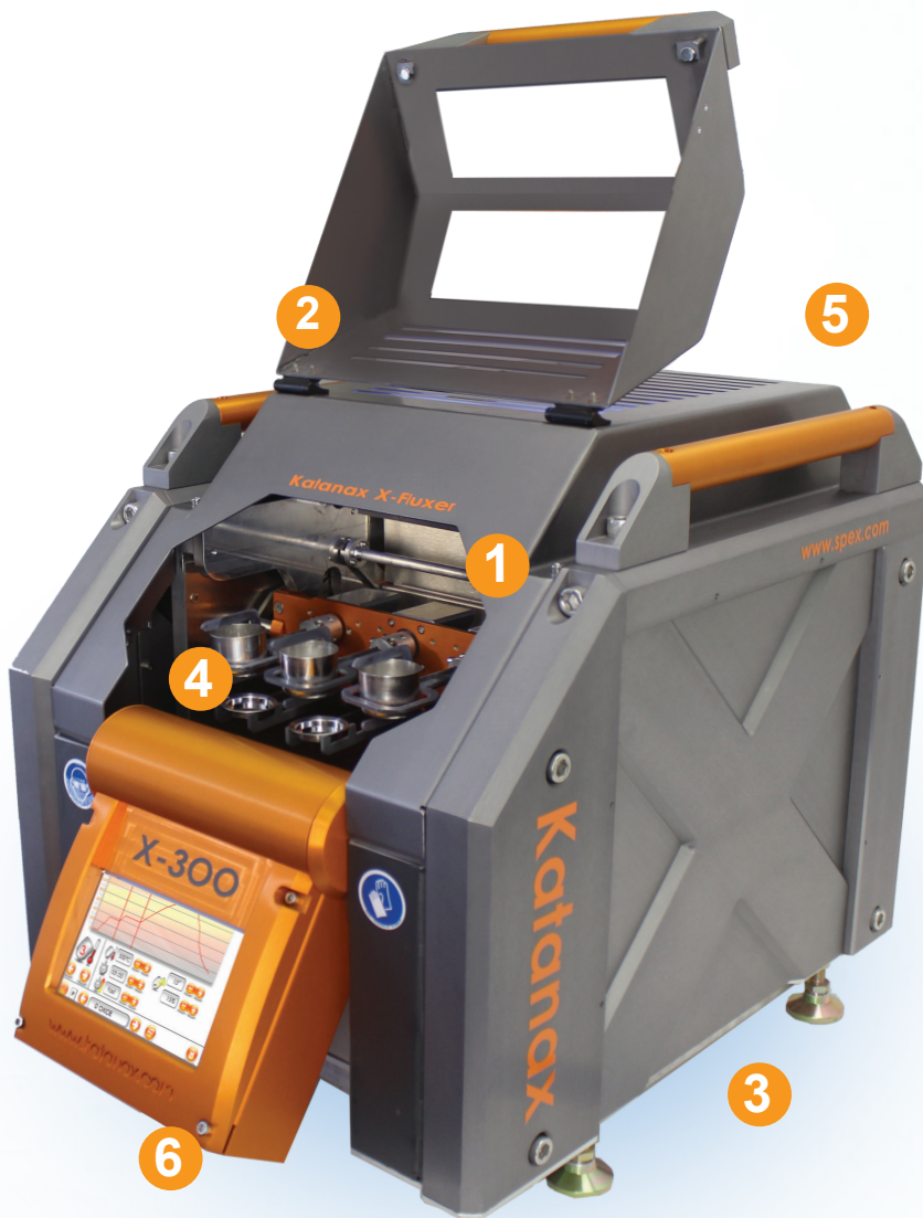
Triple Position (X-300T)

This multi-position fluxer is available as a 1, 2 or 3 position unit, it's versatile and easily adapts to the needs of today's modern laboratories.