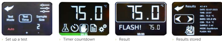
> Set up a test > Timer countdown > Result > Results stored